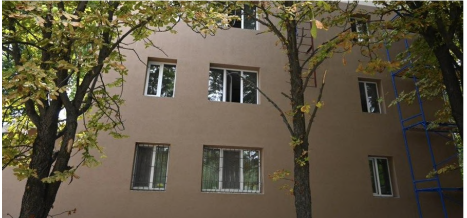
Restoration of an apartment house in Zaporizhzhia