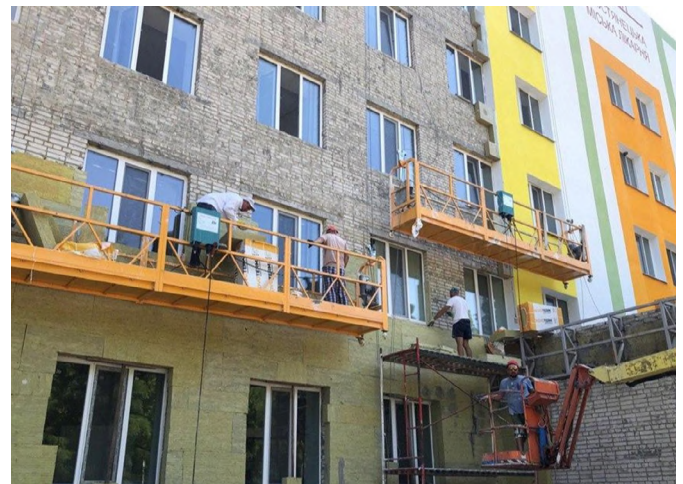
Restoration of the city hospital in Trostianets, the Sumy region

*As of July 26th, 2024, according to regional military administrations since February 24th, 2022