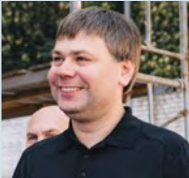
Vasyl SHKURAKOV, Acting Minister for Communities, Territories and Infrastructure Development of Ukraine:

Particular attention was paid to the autumn and winter preparations, which included ensuring the stable operation and protection of critical infrastructure facilities and building additional power generation.